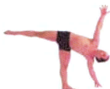
Balance, single leg strength