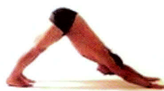
Shoulders, back & calves