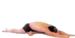
Hip/glute stretch, shoulders & back

The photos below are just a few of the poses I've found beneficial. All incorporate moves that help to lengthen and strengthen the body in areas valuable for runners. I am sure that throwers & jumpers will equally benefit from yoga.