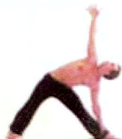
Balance, spine twist, leg strength